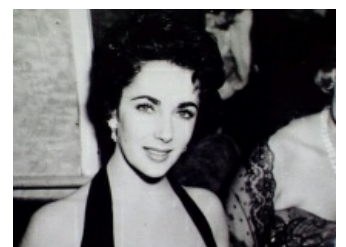
The Life of